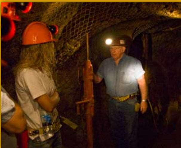
Exchangites tour the World Museum of Mining in Butte. This museum was started by the Butte Exchange Club in 1963.

Saturday afternoon consisted of free time: many attendees toured the World Museum of Mining in Butte, others golfed at Old Works.