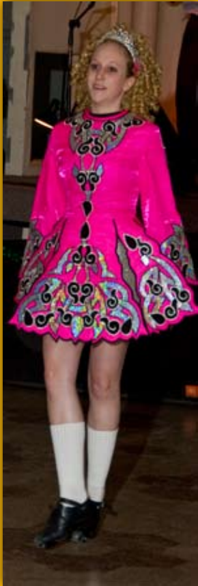
One of the Celtic dancers in an authentic costume.

Our annual District Convention was held at Fairmont Hot Springs on May 16 through 18, 2008.